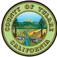
EXHIBIT A FILM / PHOTOGRAPHY PROJECT INSURANCE REQUIREMENTS

PERMITTEE shall provide and maintain insurance for the duration of this Agreement against claims for injuries to persons and damage to property which may arise from, or in connection with, performance under the Agreement by the PERMITTEE, his agents, representatives, employees and subcontractors, if applicable.